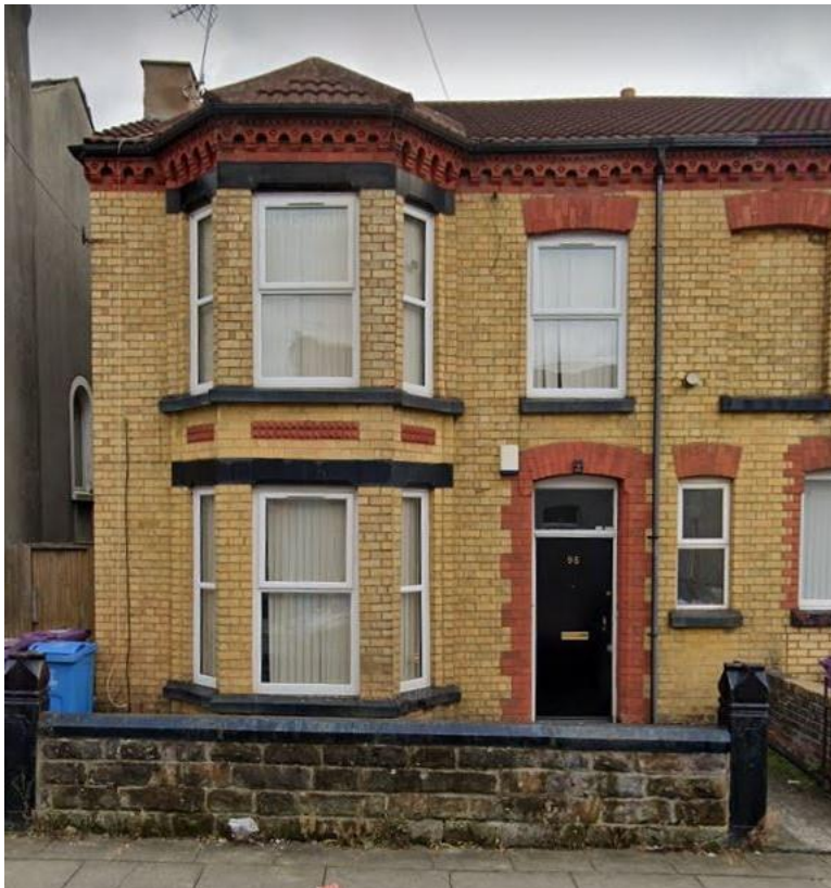
95 Salisbury Road, Liverpool